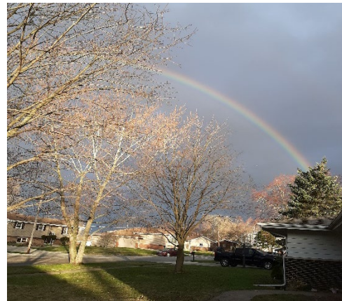
Near Dale's house, God showing off His luminous beauty for us.